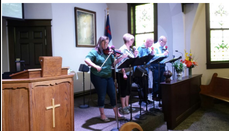
Worship Team on Father's Day!